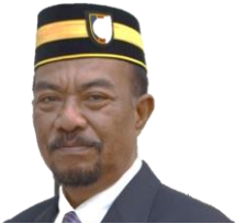
VICE PRESIDENT I