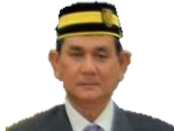
VICE PRESIDENT II